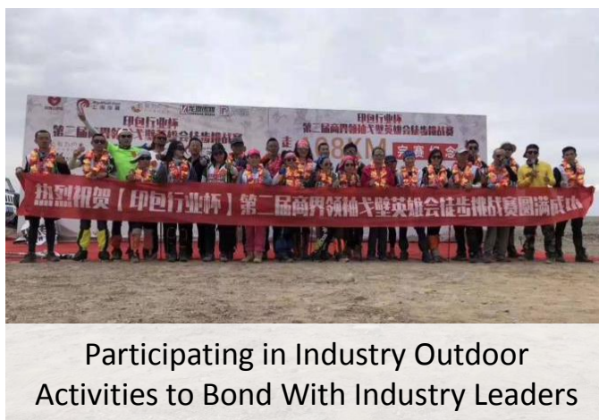
Participating in Industry Outdoor Activities to Bond With Industry Leaders