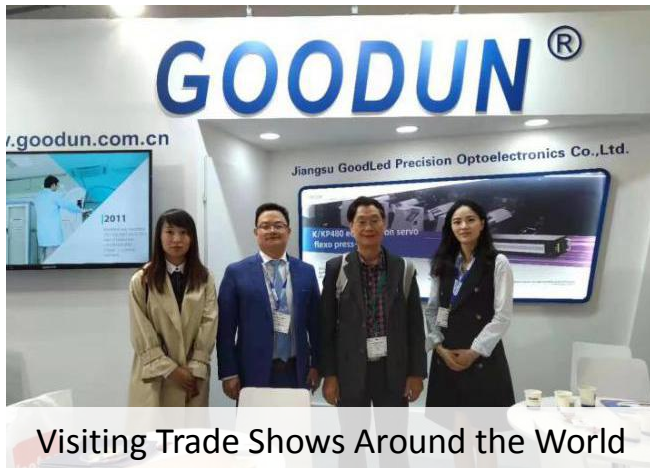
Visiting Trade Shows Around the World