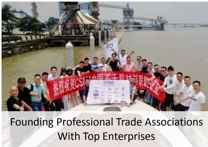
Founding Professional Trade Associations With Top Enterprises