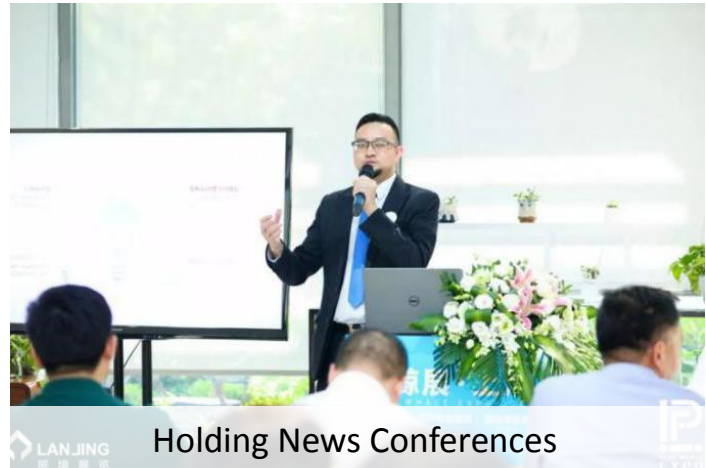
Holding News Conferences