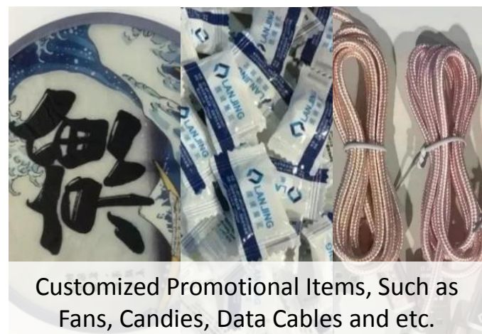
Customized Promotional Items, Such as Fans, Candies, Data Cables and etc.