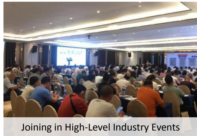
Joining in High-Level Industry Events